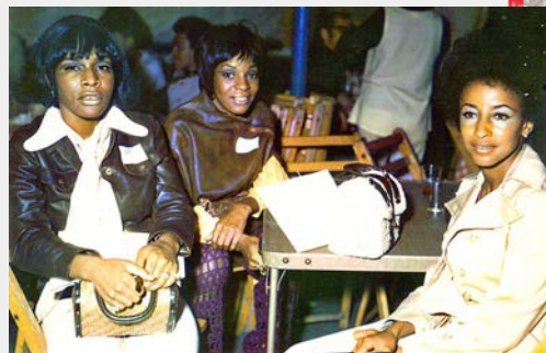
MARTHA REEVES & THE VANDELLAS ON BOBLO BOAT JULY 21ST, 1970